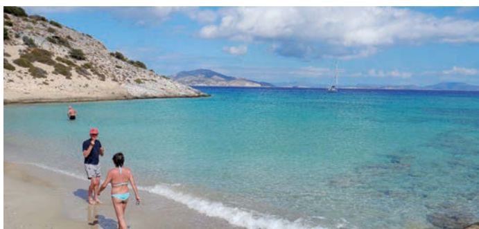
Psili Ammos Beach